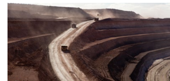
CASE STUDY: FEASIBILITY AND LIFE-OF-MINE STUDY AT MOUNT PLEASANT OPERATION

Our robust estimating capability delivers fully costed mine plans that give clients economic certainty. Our skilled team of dedicated estimators are part of a multi-disciplinary mine planning team that tests thinking to refine strategies and identify the best options. Detailed costs are analyzed and benchmarked against our extensive knowledge bank of diverse operations, further reducing unknowns and contingencies to create a total mine planning package that positions projects for long-term performance and economic success.