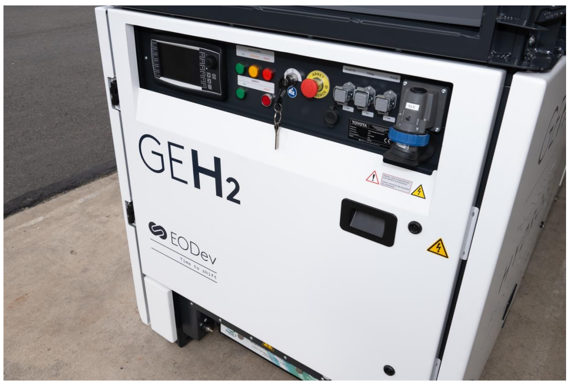
File: 24 Toyota Hydrogen Generator Event 26th Feb DSC_0715 Caption: Toyota aims to assemble 28 hydrogen fuel cell EODev GEH2 generators at its Altona production facility this year