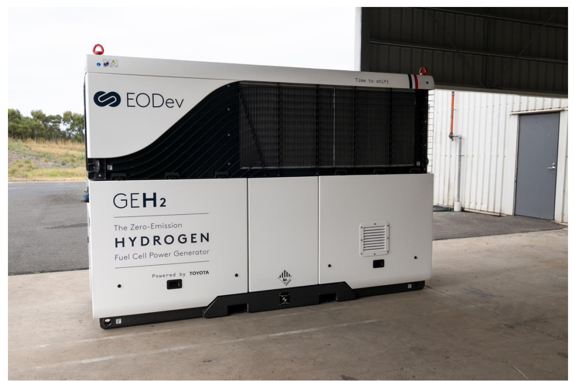
File: 24 Toyota Hydrogen Generator Event 26th Feb DSC_0628 Caption: Toyota aims to assemble 28 hydrogen fuel cell EODev GEH2 generators at its Altona production facility this year