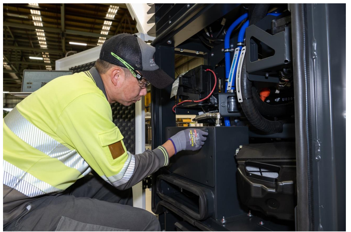
File: 24 Toyota Hydrogen Generator Event 26th Feb DSC_0660 Caption: A Toyota worker assembling the EODev GEH2 generator at Toyota' Altona production facility