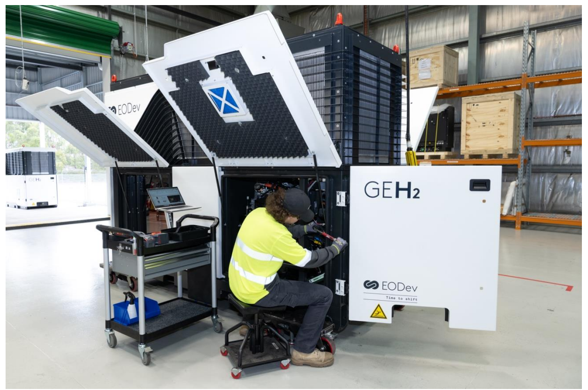
File: 24 Toyota Hydrogen Generator Event 26th Feb DSC_0643 Caption: A Toyota worker assembling the EODev GEH2 generator at Toyota' Altona production facility