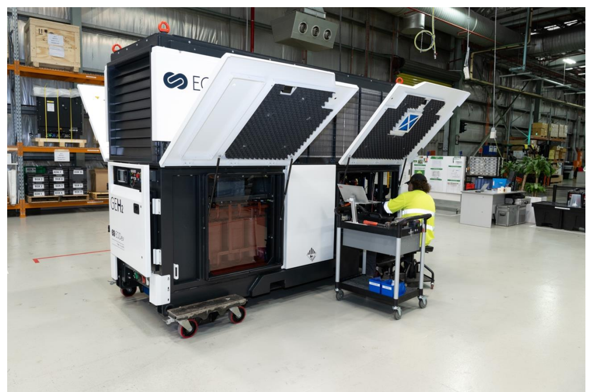
File: 24 Toyota Hydrogen Generator Event 26th Feb DSC_0641 Caption: A Toyota worker assembling the EODev GEH2 generator at Toyota' Altona production facility