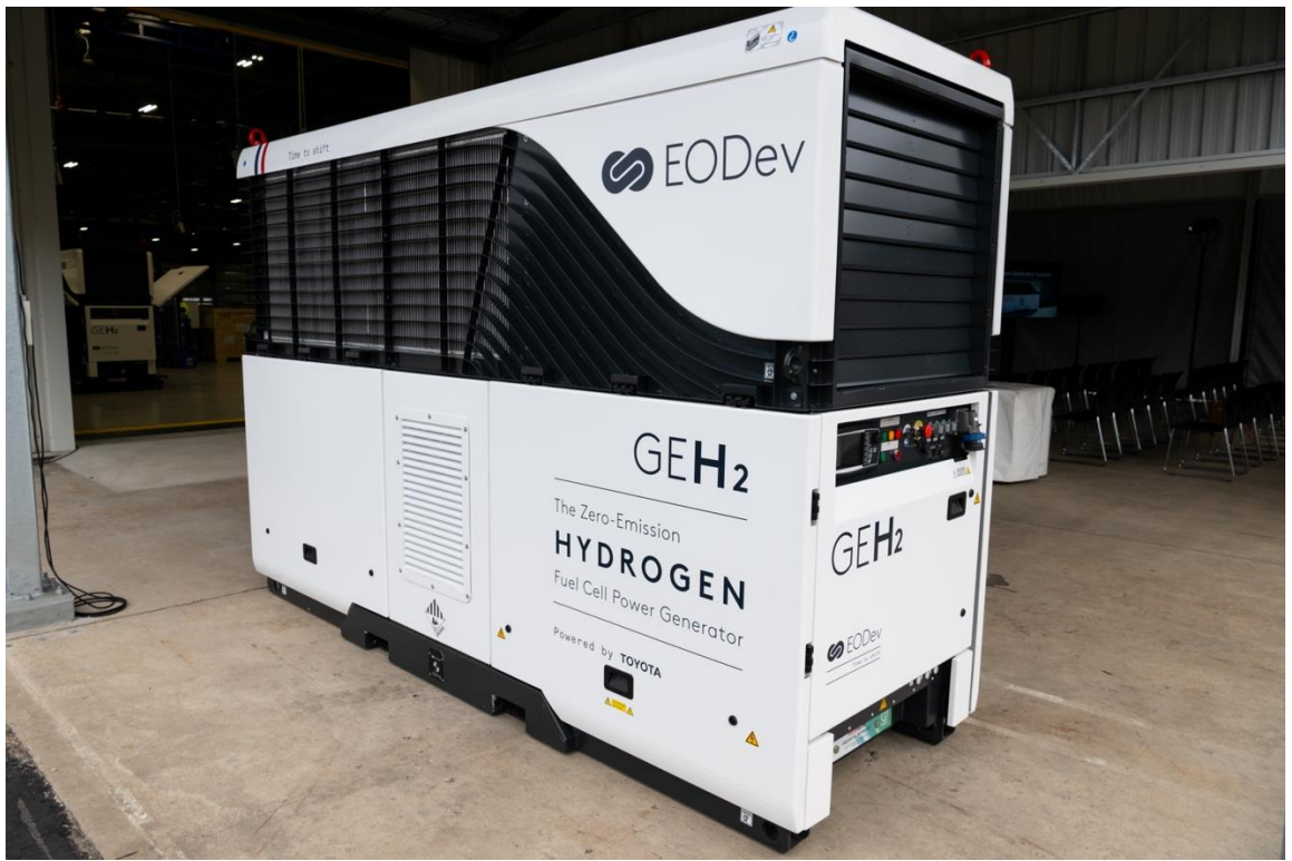
File: 24 Toyota Hydrogen Generator Event 26th Feb DSC_0634 Caption: Toyota aims to assemble 28 hydrogen fuel cell EODev GEH2 generators at its Altona production facility this year